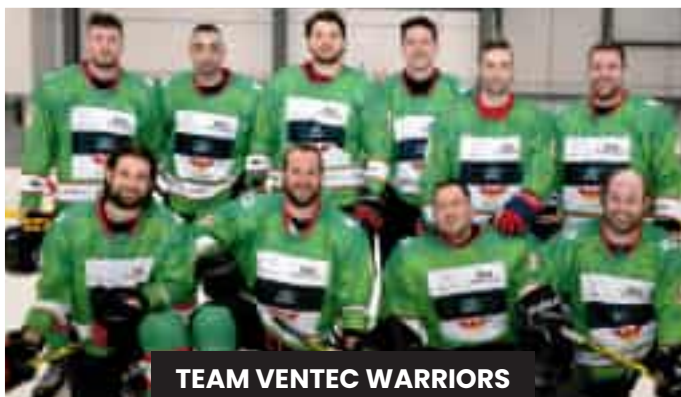
TEAM VENTEC WARRIORS