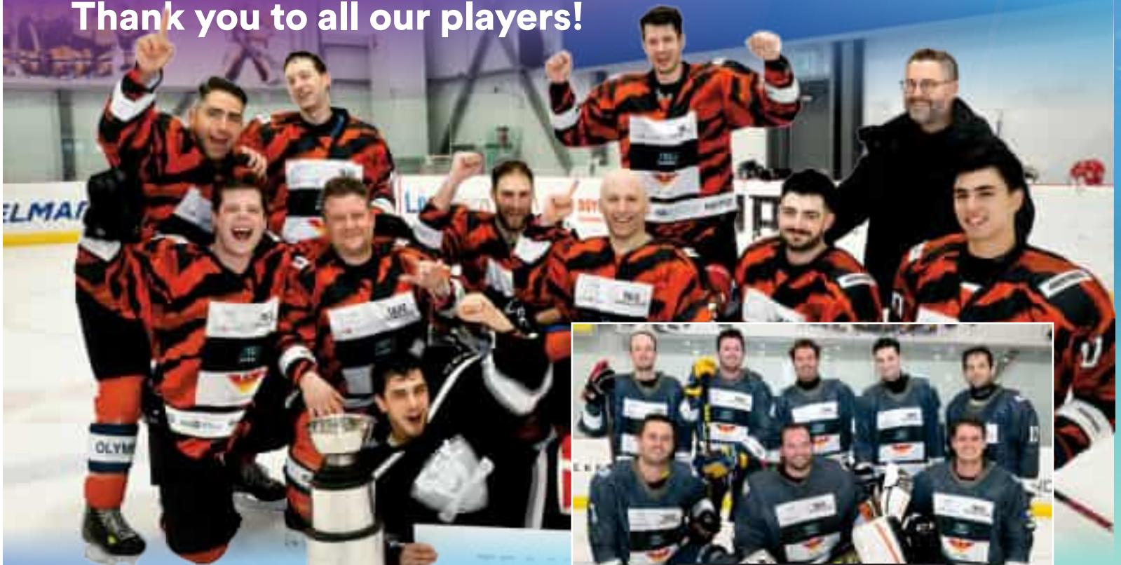
THE WINNERS: TEAM OLYMBEC