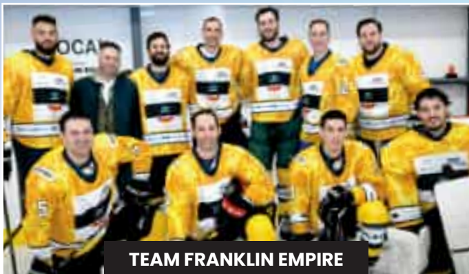
TEAM FRANKLIN EMPIRE